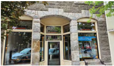
Fishtrap's new home in the Bowlby Building on Main Street, Enterprise.